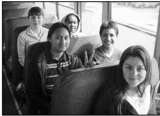
San Jose students ride the bus to their "Carnival for Quality Education"