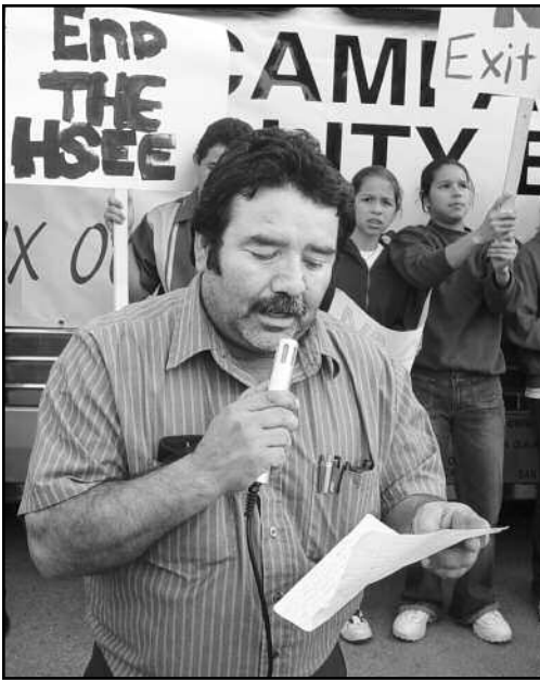
A parent speaks out at the Riverside stop of the Bus Tour.